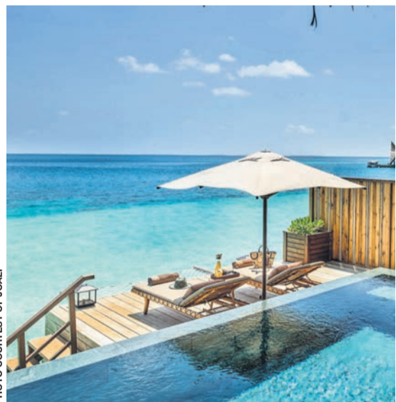
Take a dip in the pristine waters of the Indian Ocean or relax in your infinity pool at Joali's water villas.

While the Maldives is usually considered ‘the trip of a lifetime’ that comes with a hefty price tag, the increasing number of resorts across the island country offers something for all budgets and tastes