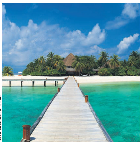
An incredible view greets you as soon as you step off your seaplane when you arrive at the Mirihi.

Pristine waters and silky smooth beaches, the Maldives is like a scene straight from paradise.